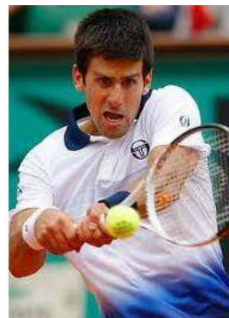
Novak Djokovic, world's no. 1 tennis player