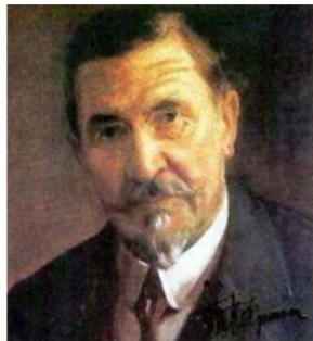
Stevan Stojanovic Mokranjac composer