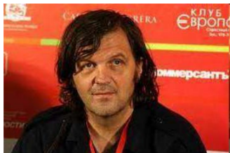
Emir Kusturica, film director