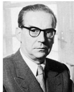
Ivo Andric, writer and Nobel Prize winner