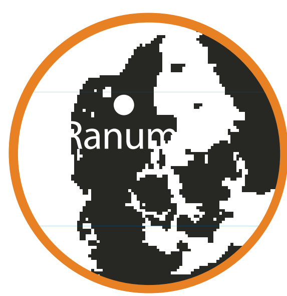
Sejlsads og strandtur