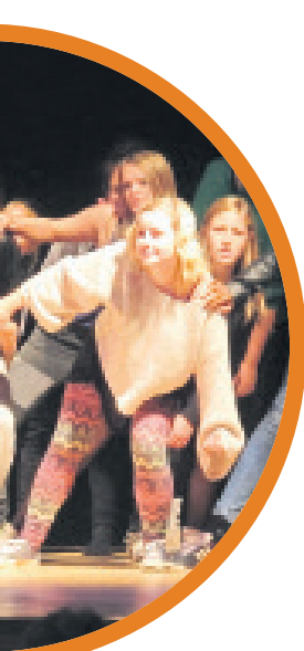
Sport og sjovt

More details: www.ranumefterskolecollege.com/summerschool