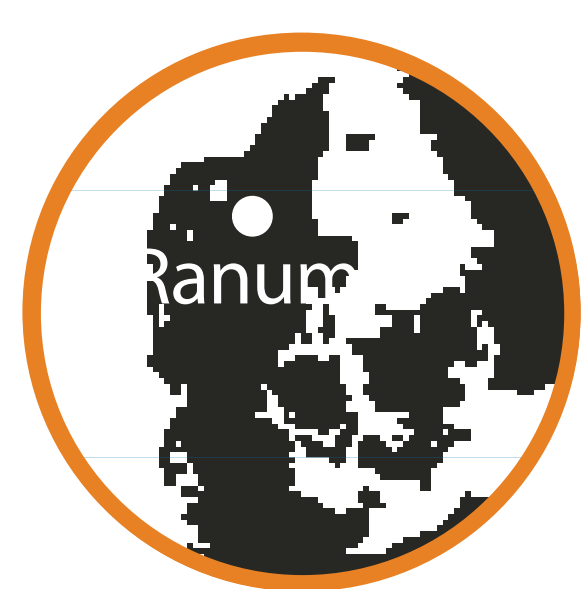
Sejlsads og strandtur