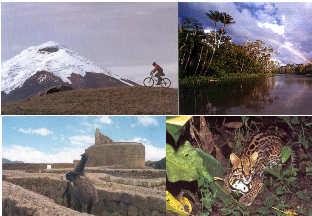
Snow-peaked volcanoes, tropical landscapes and much, much more...