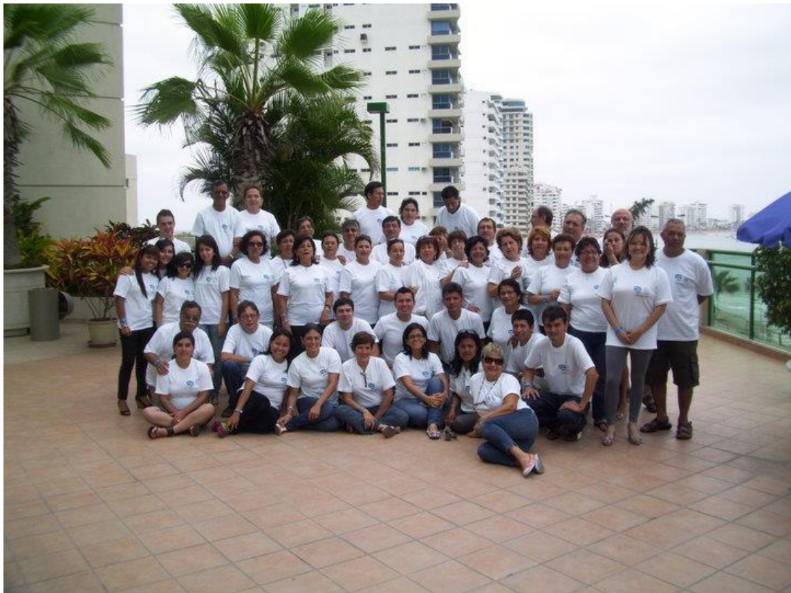
Some of AFS Ecuador's volunteers and staff at a recent annual meeting and GA